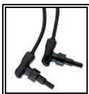
90° Universal connectors 4.0-4.7mm